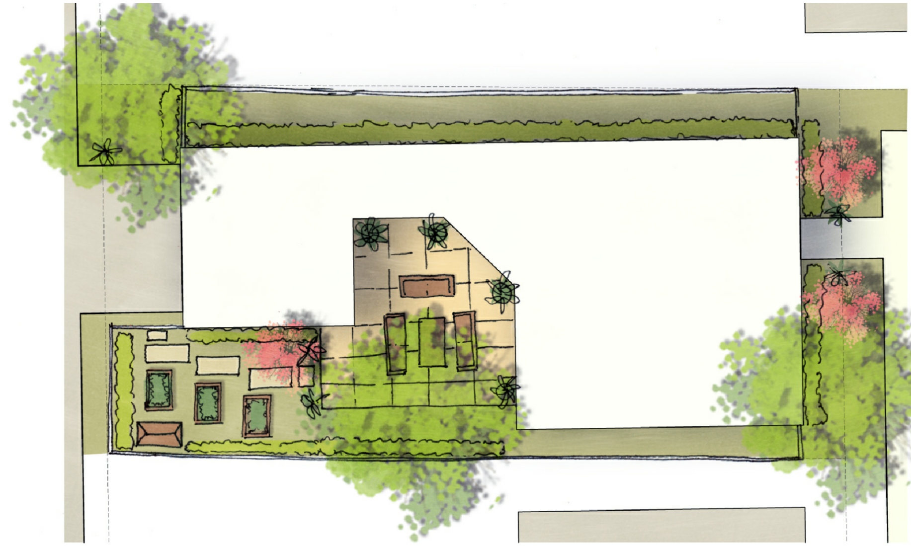
2 SINGLE FAMILY DETACHED TYP SMALL PRIVATE YARD SCALE: 1" = 10' - 0"