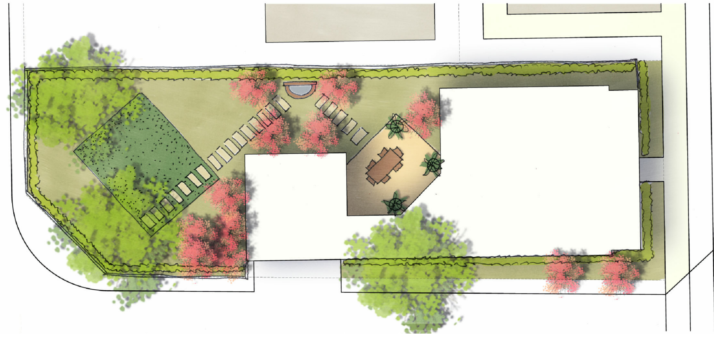
1 SINGLE FAMILY DETACHED TYP LARGE PRIVATE YARD SCALE: 1" = 10' - 0"